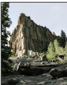
One of nearly 100 fantastic formations in Rock Creek..